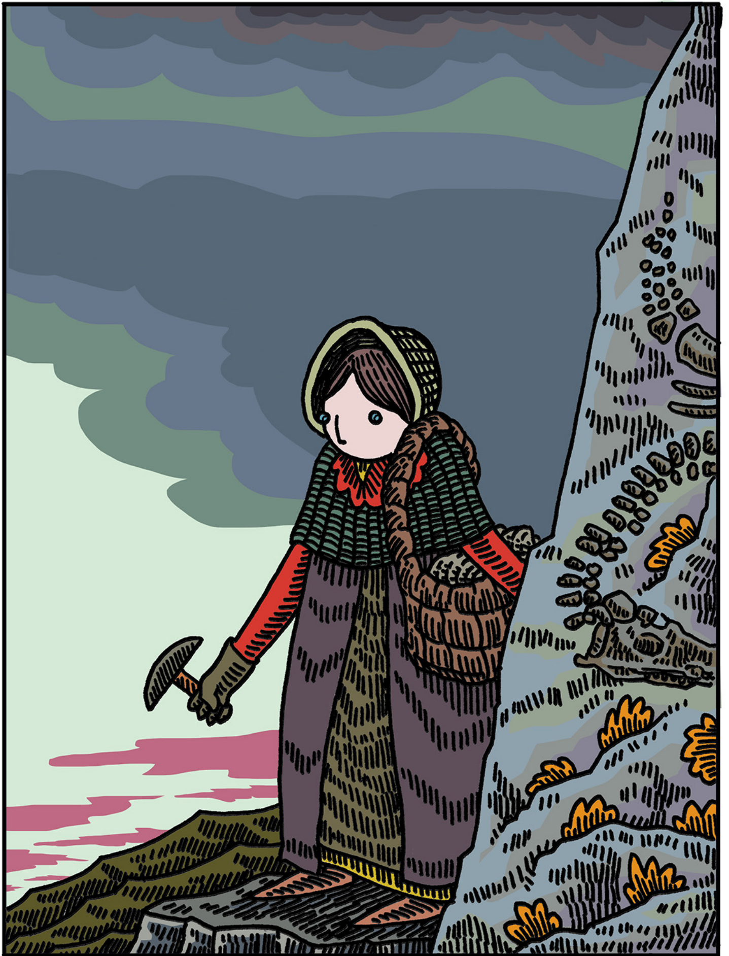
MARY ANNING — FOSSIL COLLECTOR. 1799—1847