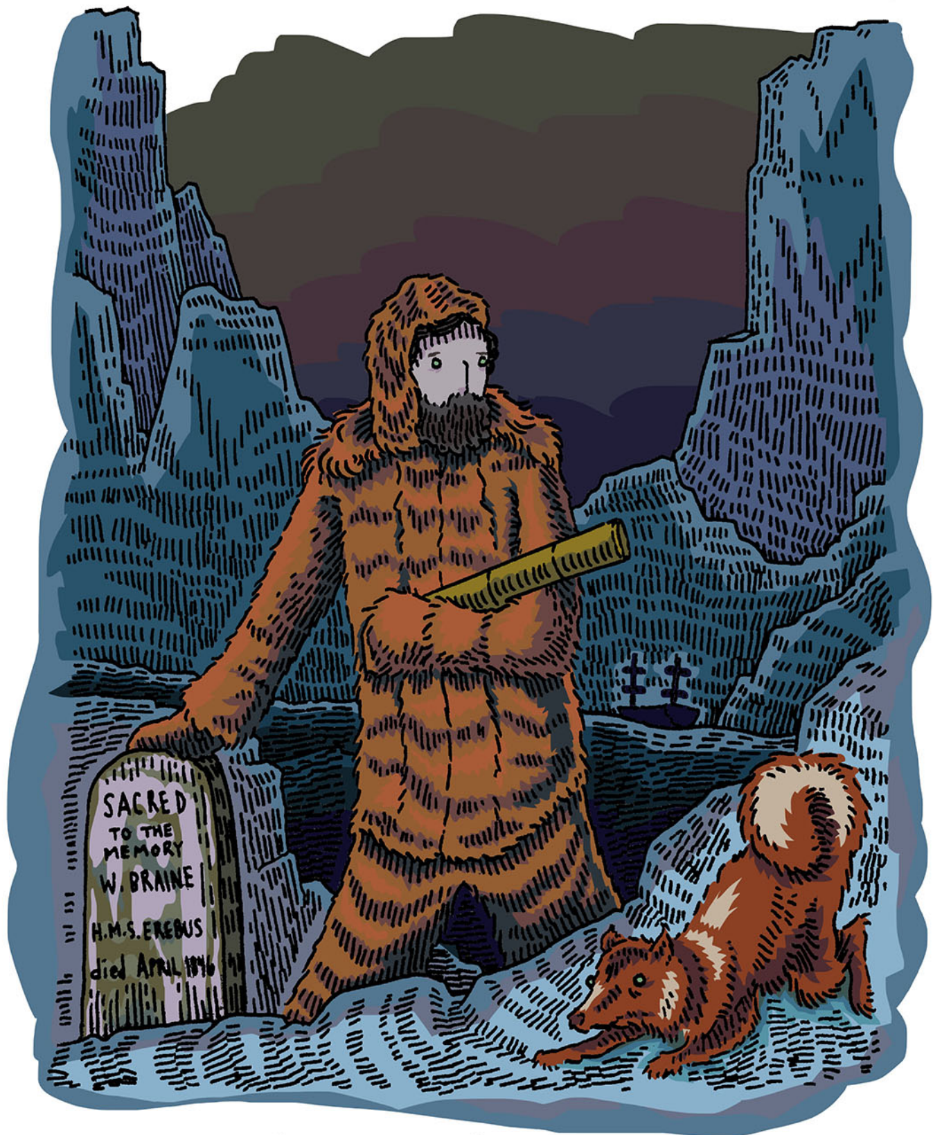
ELISHA KENT KANE 1820–1857 (BADASS POLAR EXPLORER)