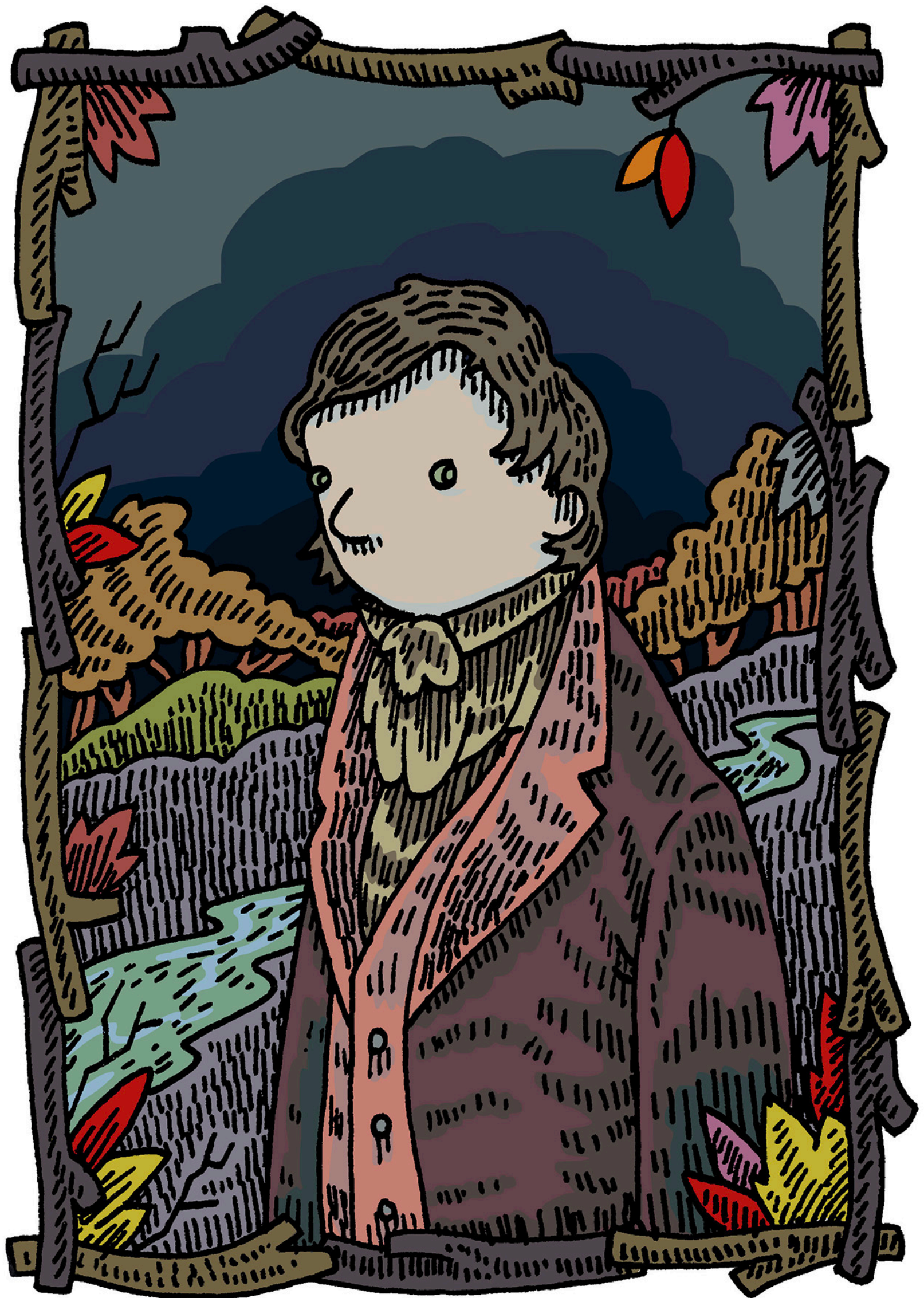
WASHINGTON IRVING — AUTHOR. 1783—1859